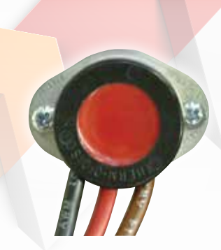
Defrost Termination/ Fan Delay Thermostat